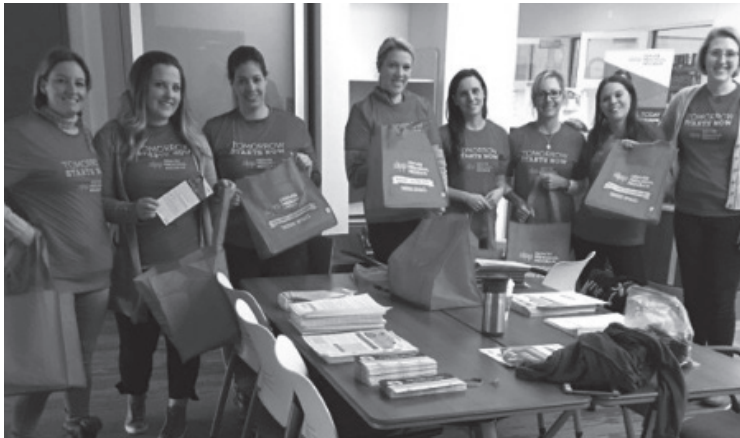
JLD members volunteer at a Done in a Day for the Denver Preschool Showcase in January. Sign up for upcoming Done in a Days online! Questions? Email doneineaday@jld.org .