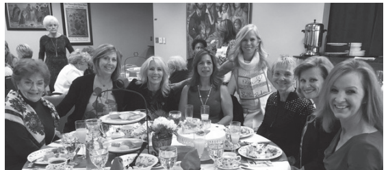
JLD members and friends gathered in December to support those who designed intricate displays at the Tables Extraordinaire event.

On December 1, Sustainers participated in the Tables Extraordinaire event at St. Catherine Greek Orthodox Church in Greenwood Village. Attendees marveled at the displays that so many put their time and effort into.